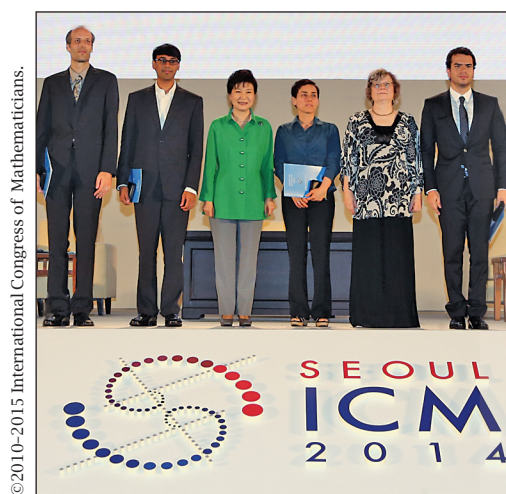
L–R: Martin Hairer, Manjul Bhargava, South Korean president Park Geun-hye, Maryam Mirzakhani, IMU president Ingrid Daubechies, and Artur Avila.