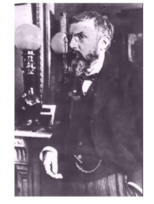
Joseph Louis Lagrange