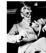
G.H. Hardy (1877 – 1947)