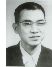
Chen Jingrun 1933 – 1996