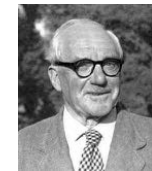
J.E. Littlewood (1885 – 1977)