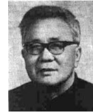
Hua Luogeng 1910 – 1985

http://www.imj-prg.fr/~michel.waldschmidt/