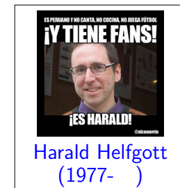
Harald Helfgott (1977- )

Every odd number greater than 7 can be expressed as the sum of three odd primes.