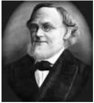
Christian Goldbach (1690 – 1764)