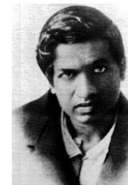
Srinivasa Ramanujan (1887 – 1920)