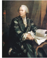
Leonhard Euler (1707 – 1783)

Letter of Goldbach to Euler, 1742 : any integer \geq 6 is sum of three primes.