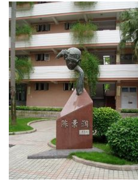
Chen's statue in Xiamen University