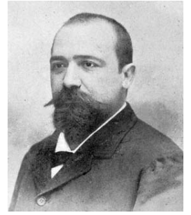
Ernesto Cesàro (1859 – 1906)